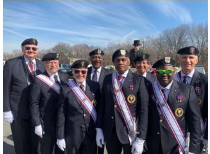
2020 Washington Birthday Parade KofC Color Corps