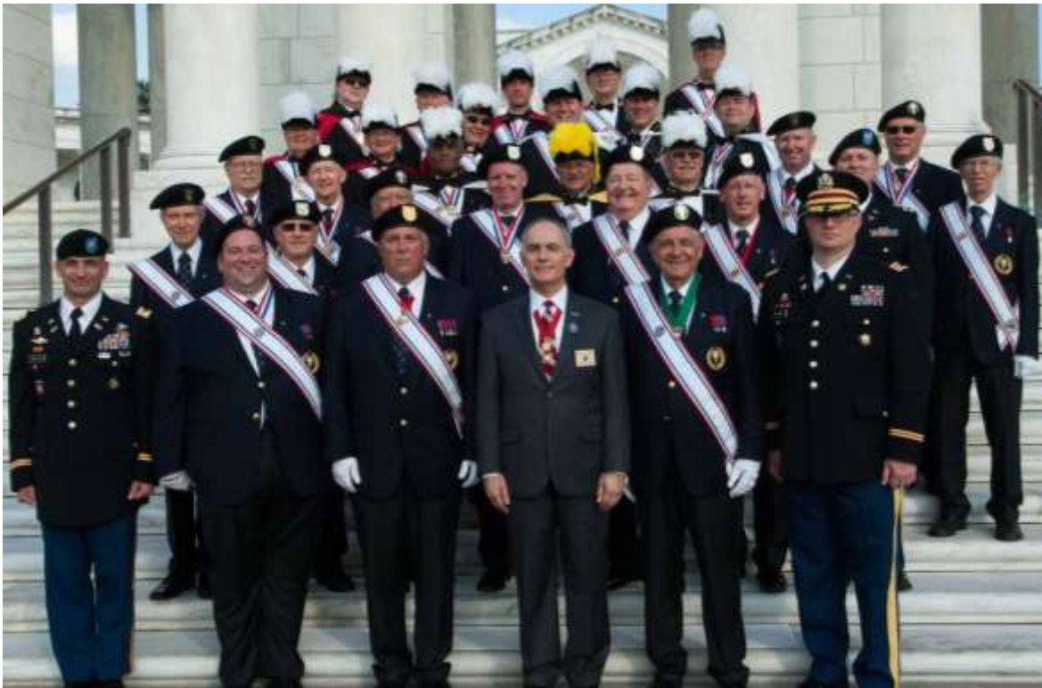
Participants in Wreath Laying Ceremony

Participants in the Wreath Laying Ceremony, held Columbus Day, Monday, October 9, 2018, included: